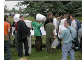
Big Cup Syndrome

NFACC's National Farm Animal Care & Welfare Conference, September 20 & 21, 2007 La Conférence nationale du CNSAE sur le bien-être et la protection des animaux d'élevage, 20 et 21 septembre 2007